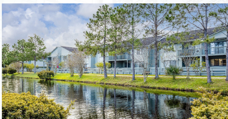
JACKSONVILLE, FLORIDA $30,000,000 Multi-Family