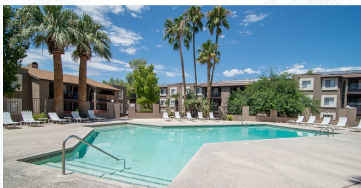
TUCSON, ARIZONA $44,575,000 Multi-Family

For 25 years, Trez Capital has been a trusted provider of private commercial real estate financing solutions in the U.S. and Canada. With over $5.3 billion* in AUM, we have funded more than 1,700 transactions in excess of $17 billion since the firm's inception in 1997.