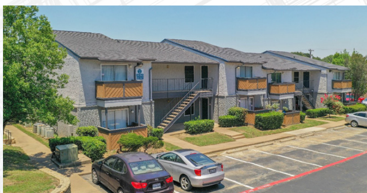
BEDFORD, TEXAS $39,200,000 Multi-Family